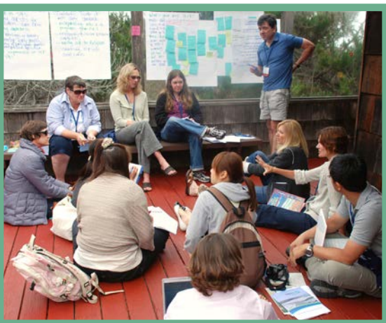
Marine educators participating in a pre-conference workshop, Designing Professional Development to Support Ocean Literacy. June 29, 2009

Our one global ocean is the defining feature of our planet. It makes Earth habitable, influences our weather and climate, and supports a great diversity of life and ecosystems. While largely unexplored, the connection between the ocean and humans is undeniable. These ideas are the foundation of what has become an international effort to increase ocean literacy—to help each of us understand the ocean’s influence on us and our influence on the ocean.