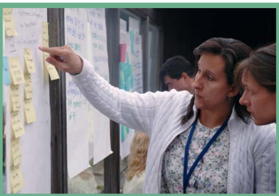
Marine educators discussing characteristics of effective professional development at a pre-conference workshop, Designing Professional Development to Support Ocean Literacy. June 29, 2009 (Photo credit: Craig Strang).